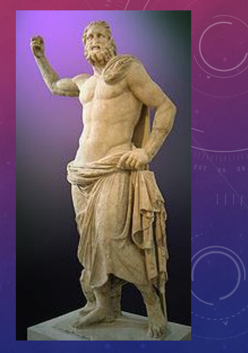
Statue of Poseidon from Milos, 2nd century BC